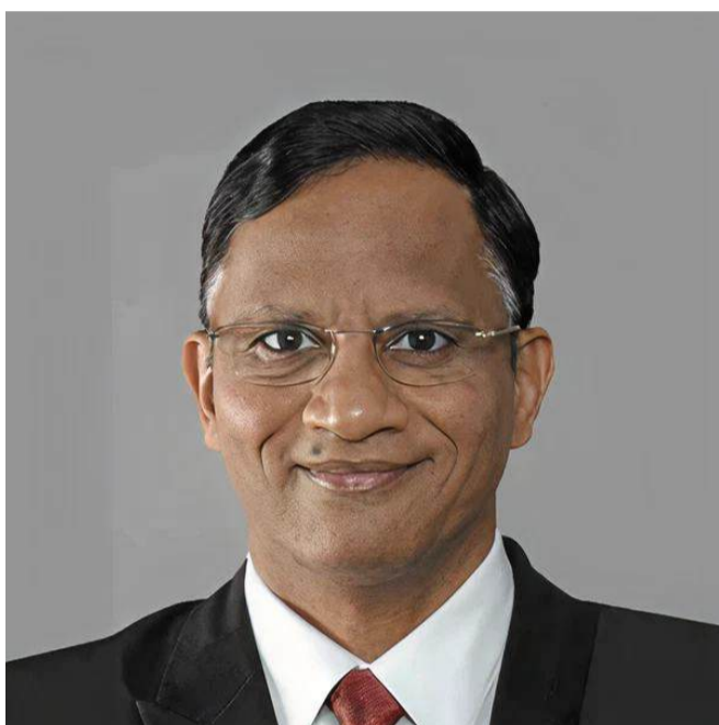
Anil V Parab Chairman Capital Goods & Strategic Skills Council (CGSSC)

As we navigate the rapidly evolving landscape of advanced Manufacturing & Industry 4.0, the definition of "manufacturing excellence" is being rewritten. At the Capital Goods and Strategic Skill Council (CGSSC), we recognize that the heartbeat of India's industrial transformation specifically within the defense and high-end manufacturing sectors lies not just in the machinery we deploy, but in the caliber of the workforce operating it.